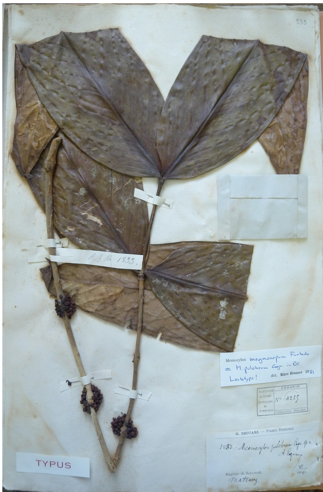
Fig. 1. Image of a syntype of Memecylon megacarpum Furtado [Beccari 1833 (FI)].