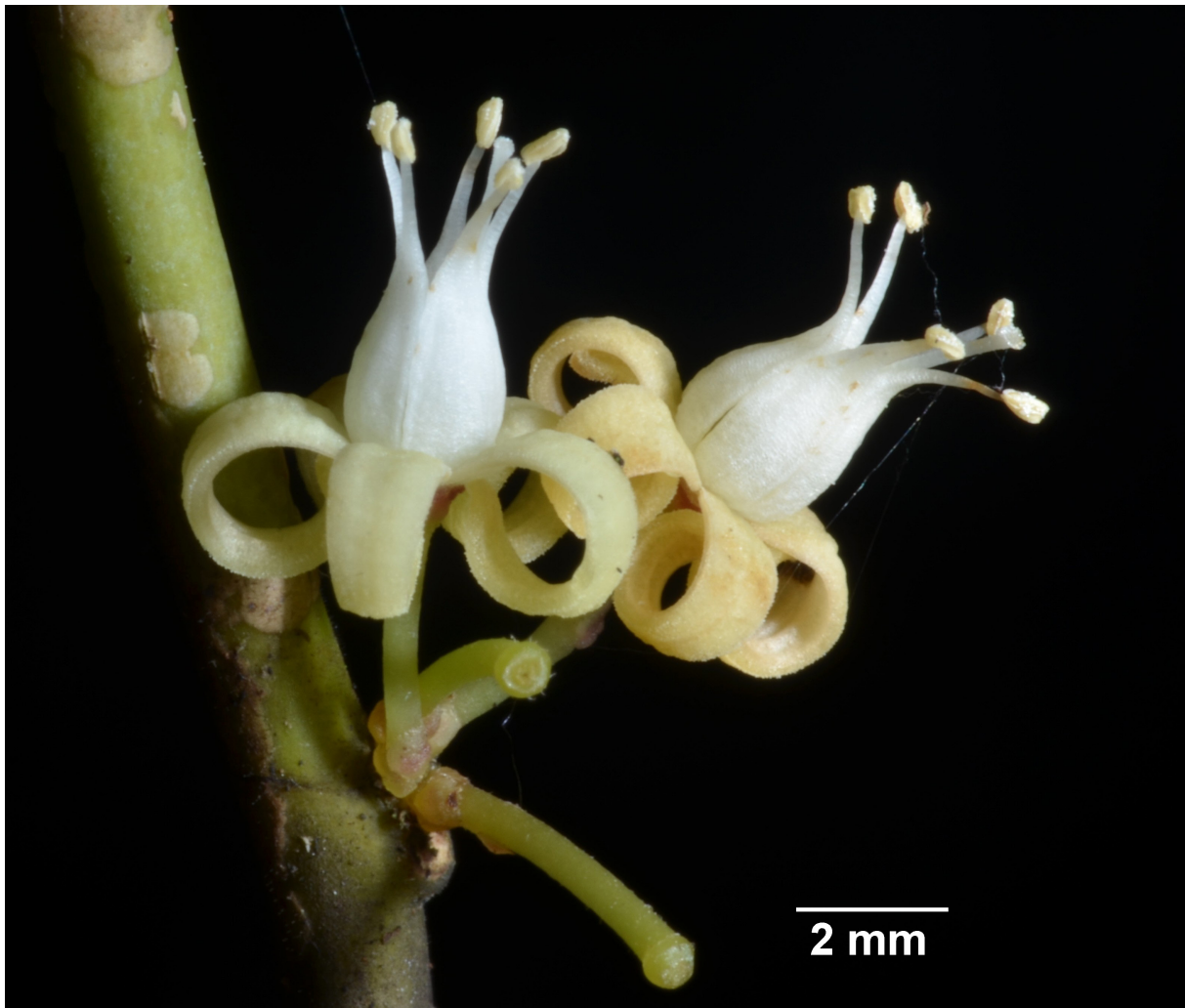
Fig. 2. Rhaphiostylis preussii Engl. showing flowers with the flattened filaments closing around the ovary while the petals are bending down. from Bidault 786 (MO) from Gabon.