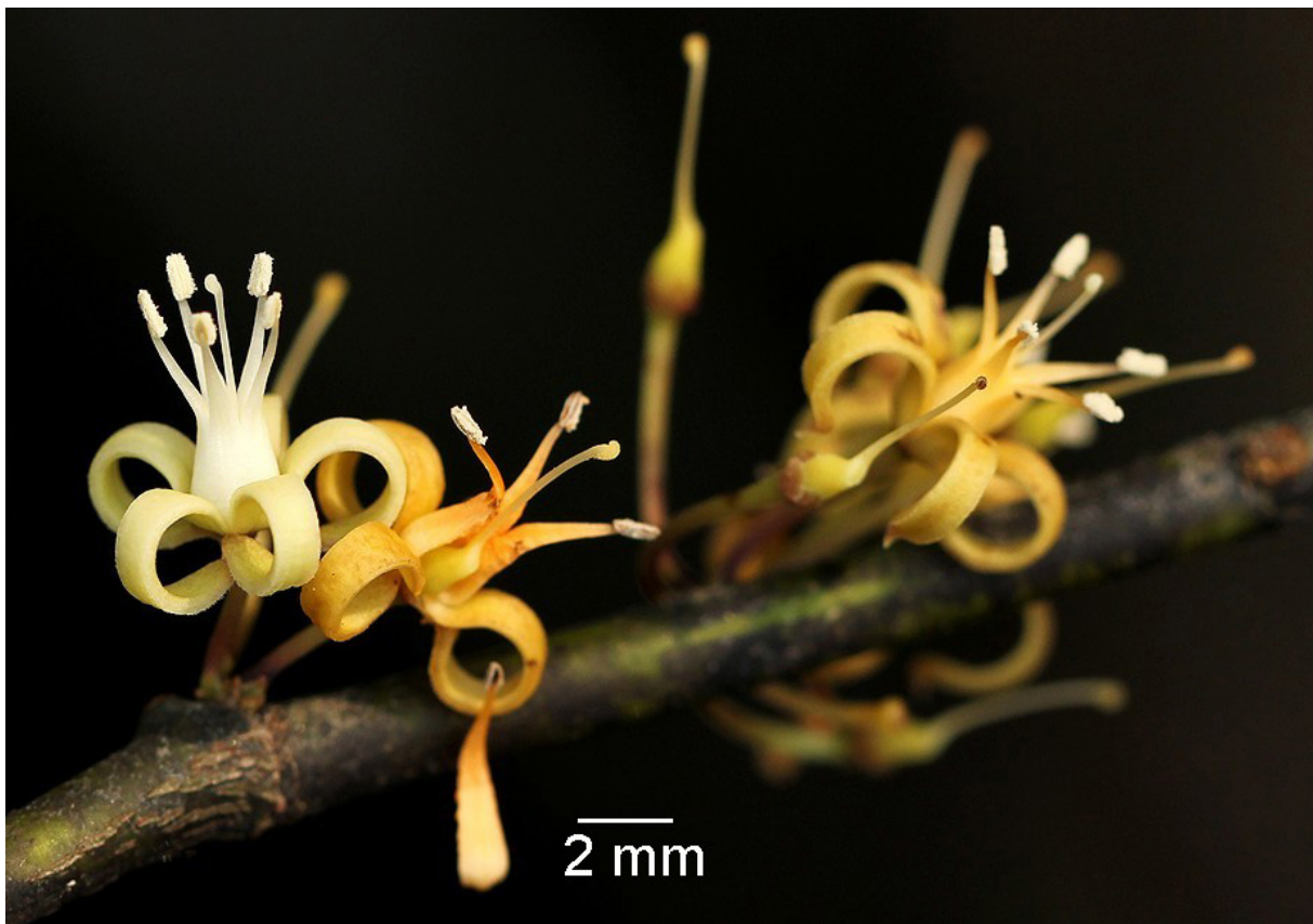
Fig. 3. Rhaphiostylis beninensis (Hook.f. ex Planch.) Planch. ex Benth., like Fig. 2, but also showing ovary and style in older flowers. Photograph by Bart Wursten from Boyekoli Ebale Botany 785 (BR) from Congo Kinshasa (copyright Botanic Garden Meise).

part of Liberia, and while it is not sure that the species grows in a protected area, “Vulnerable” should be the correct status for the moment (B1 & B2 ab(iii), IUCN 2015).