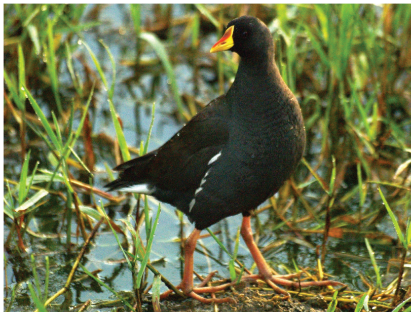
Fig. 2. Lesser Moorhen Paragallinula angulata Sundevall, 1850, Kgomo Kgomo, South Africa, Feb. 2011. This photograph illustrates two diagnostic character states differentiating Paragallinula from the genus Gallinula : the orange colouration on the frontal shield does not cover the entire shield, and the lack of a contrasting reddish band on the legs proximal to the ankle joint.

Paragallinula gen. nov. further differs from Tribonyx in (ii) broad naked area on crown in downy plumage (absent in Tribonyx ); (iii) long, filamentous white filoplumes in downy plumage (absent in Tribonyx ); (iv) frontal shield with acuminate posterior margin (rounded in Tribonyx ); (v) undertail-coverts white dorsolaterally, black ventromedially (entirely blackish in Tribonyx ); (vi) six pairs of rectrices (eight in Tribonyx ); (vii) underwing-coverts dark grey, blackish or black (medium brown in Tribonyx ); and (viii)