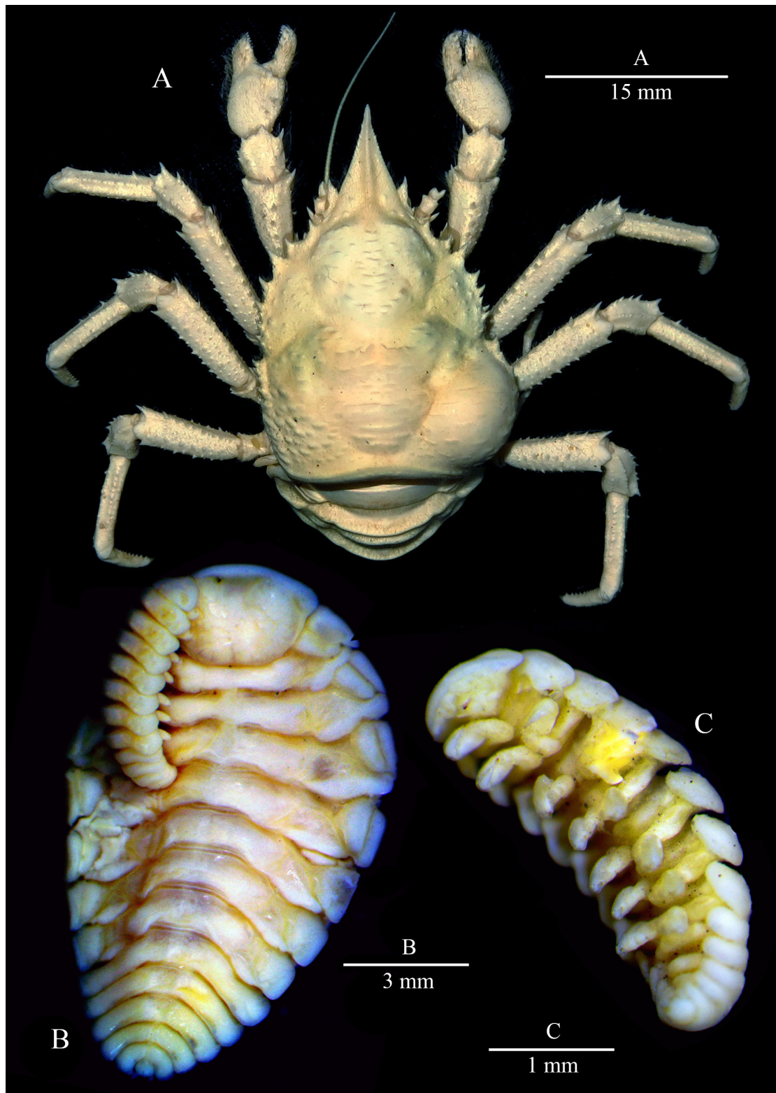
Fig. 1. Micrographs of Pleurocryptella altalis sp. nov. and host Munidopsis petalorhyncha Baba, 2005 (ZMMU Ma 3504). A. Munidopsis petalorhyncha , ♂, with swelled right branchial chamber from Pleurocryptella altalis sp. nov. B. Pleurocryptella altalis sp. nov., holotype, ♀, dorsal view (ZMMU Mc 1420) with attached allotype, ♂ (ZMMU Mc 1421). C. Pleurocryptella altalis sp. nov., allotype, ♂, oblique ventral view (ZMMU Mc 1421).