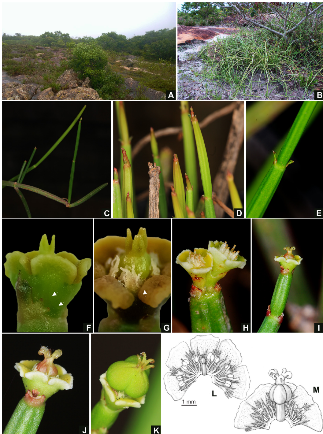
Fig. 4. Euphorbia sobolifera O.L.M.Silva & P.J.Braun sp. nov. A. Habitat. B. Habit. C. Portion of a branch producing soboles. D. Apical portion of branches with reduced opposite leaves. E. Detail of a node with opposite leaves. F. Cyathium showing one of the cyathophylls bearing colleters on its margin (arrows). G. Detail of a cyathium showing an involucre lobe (arrow). H. Grouped staminate cyathia. I. Solitary pistillate cyathium. J. Detail of a pistillate cyathium showing the pistillate flower. K. Immature fruit. L. Staminate cyathium opened, showing staminate cymules, bracteoles and a central pistillode. M. Pistillate cyathium opened, showing poorly developed staminate flowers and bracteoles. Photos: A–B: P.J. Braun in the field; C–K: O.L.M. Silva; L–M: Illustrations of plants cultivated at the Instituto de Botânica by Klei Souza.