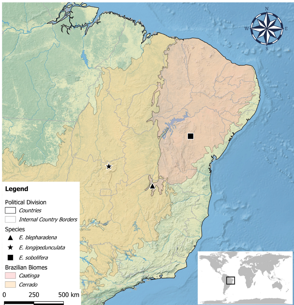
Fig. 2. Geographical distribution of Euphorbia blepharadena O.L.M.Silva & Cordeiro sp. nov. (triangle), E. longipedunculata O.L.M.Silva & Riina sp. nov. (star) and E. sobolifera O.L.M.Silva & P.J.Braun sp. nov. (square).

Euphorbia blepharadena sp. nov. is only known from a single locality (Fig. 2), with AOO < 10 km 2 and EOO < 100 km 2 . Its habitat is subjected to continuing decline in area, extent and quality. In the light of this, our evaluation suggests it to be classified as Critically Endangered (CR; B2ab[iii]).