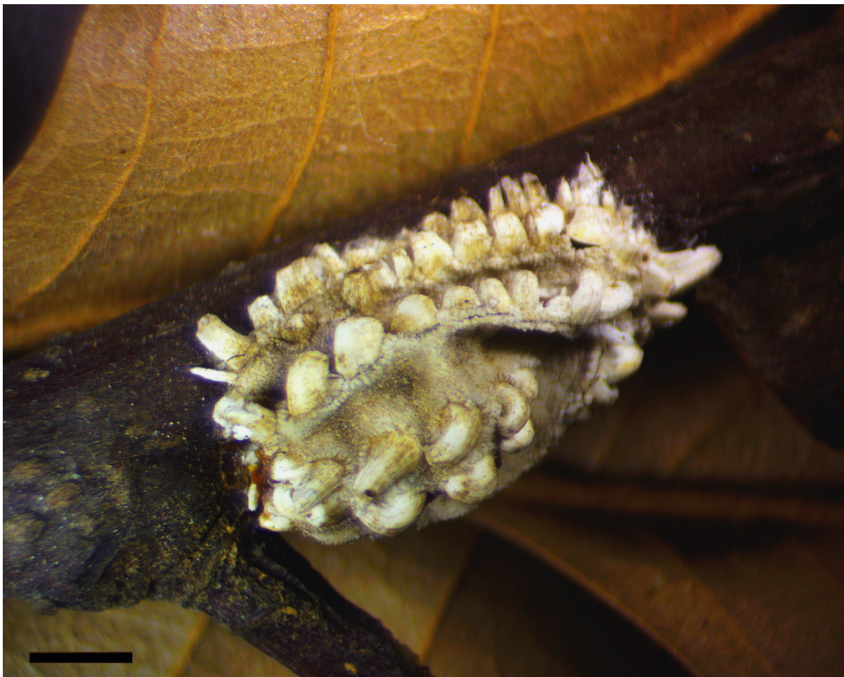
Fig. 1. Gompholopium quercicola gen et sp. nov., paratype, dry ♀ (ZIN RAS, K 1548) on twig of host plant. Scale bar = 1 mm.