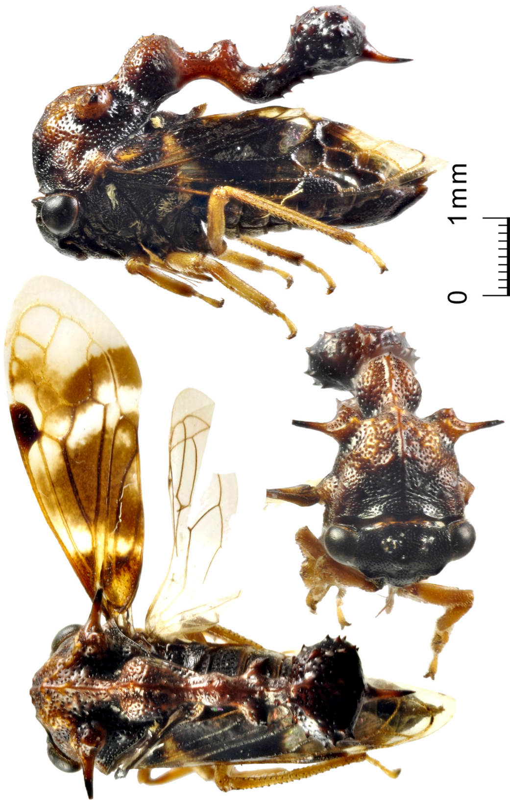
Fig. 3. Hamma caneparii sp. nov., holotype, ♀, Gabon, Ogooué Lolo, Inzambò (Iboundji), m 427, 0.1°6'21.7" S, 0.11°51'17.8" E, 24 Nov. 2012, A. Susini leg. (MSNS).