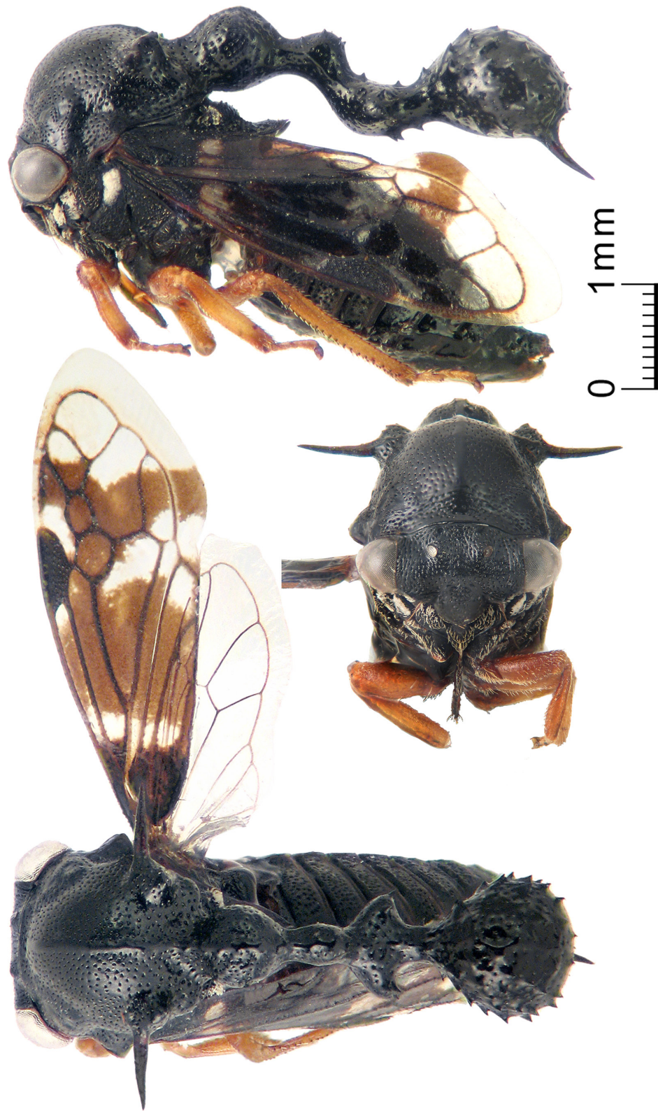
Fig. 1. Hamma nigrum sp. nov., holotype, ♀, Gabon, Ogouè Ivindo, Batuala, 1 Dec. 2012, A. Susini leg. (MSNS).