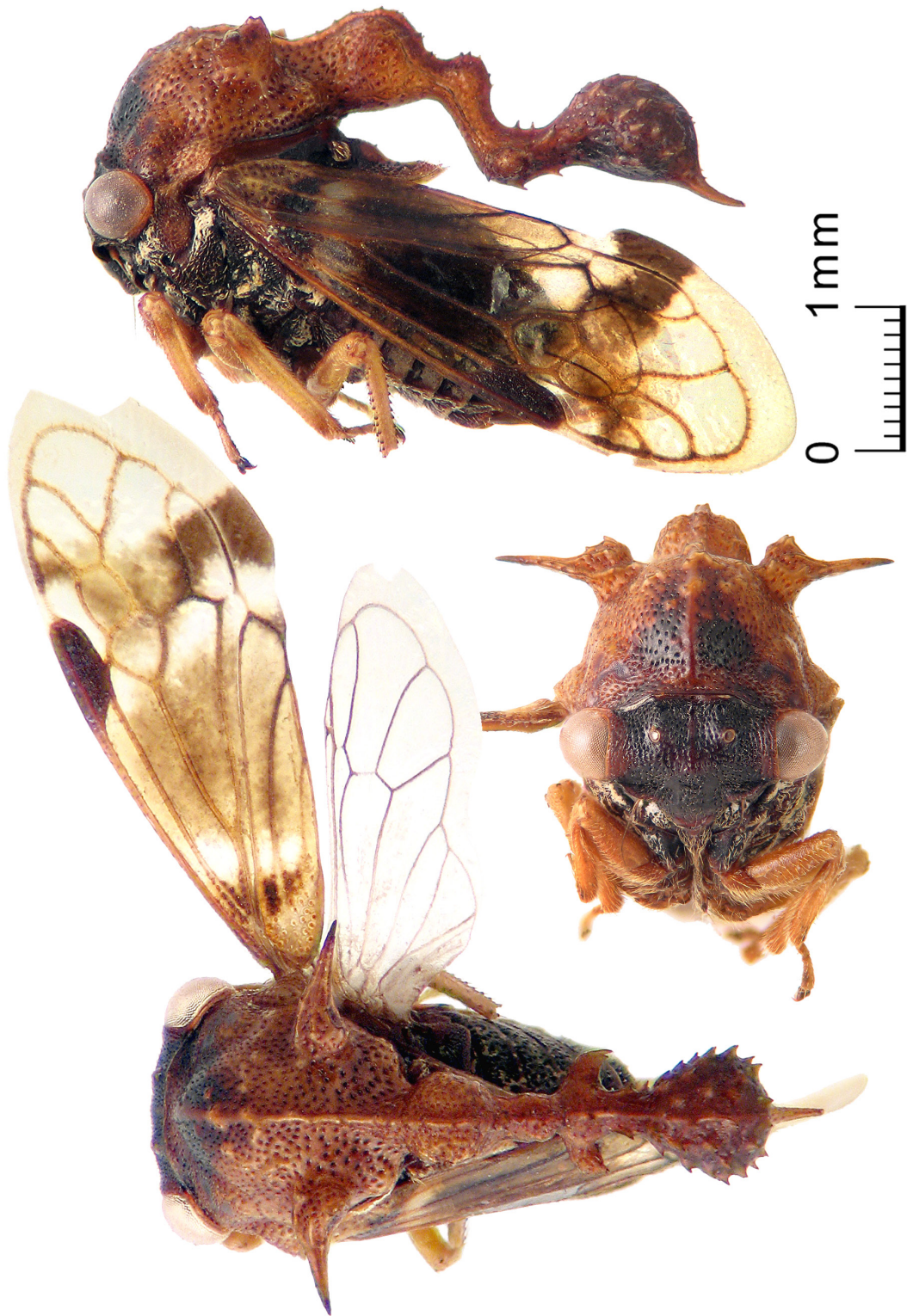
Fig. 2. Hamma spinellii sp. nov., holotype, ♀, Gabon, Ogoûé Ivindo, Mont Sassamongou, Batouala, 30 Nov. 2012, A. Susini leg. (MSNS).