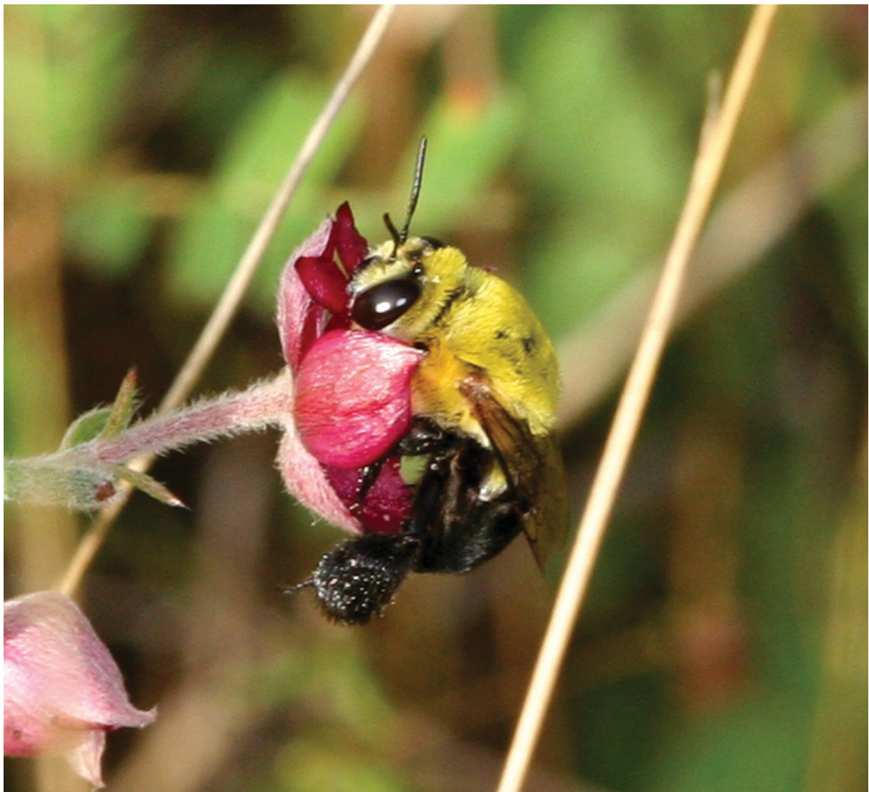
Fig. 4. Female of Centris (Relicthemis) xanthomelaena Moure & Castro, 2001 visiting Krameria sp. (Krameriaceae) in Estação Ecológica do Seridó, Rio Grande do Norte State, Brazil.

The distinctiveness of Centris xanthomelaena as compared with the previously described subgenera of Centris was already characterized by Zanella (2002), especially based on the analysis of male genitalia. In the key for subgenera of Centris of Michener (2007), this species fits in Paracentris , considering the “female’s basitibial plate with defined secondary plate that lacks sharp projecting margin” and the “margin of secondary plate extending [...] near posterior margin of basitibial plate” (dilemma 13), while the male’s lateral ocellus is separated from the eyes by a distance similar to the ocellar diameter, and the T2–T4 covered with dark pubescence (dilemma 20). Nevertheless, males of C. xanthomelaena are clearly distinguished from males of Paracentris by the strong emargination on the apical margin of T7 (Fig. 2B), by the absence of emargination on the basal border of S7 (Fig. 2B), and by the presence of a long dorsoapical projection of gonocoxite, ca \frac{2}{3} lengths of gonostylus (Fig. 2E–F). This latter feature is unique, being a somewhat intermediate condition between that observed in Centris s. str. and Paracentris .