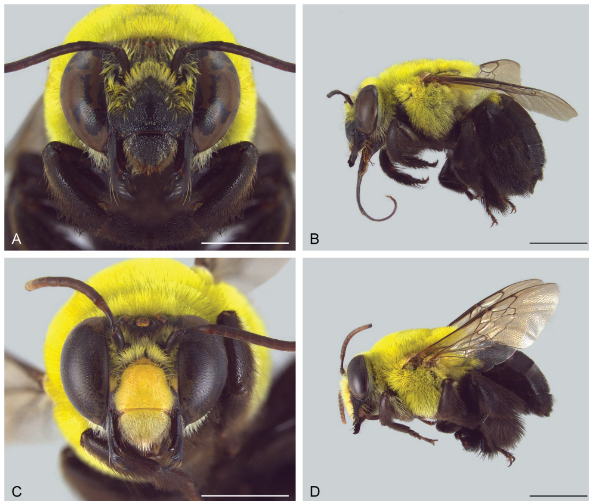
Fig. 1. Centris (Relicthemia) xanthomelaena Moure & Castro, 2001. A–B. ♀. A. Frontal view. B. Habitus, lateral view. C–D. ♂. C. Frontal view. D. Habitus, lateral view. Scale bars: A, C = 2 mm; B, D = 5 mm.

Integument dark brown to black, except flagellum dark brown and tegula yellowish brown (Fig. 1A–B). Wings brown with veins dark brown (Fig. 1B). Head, mesosoma (except the ventral surface) and anterior half of T1 with intense yellow slightly greenish pilosity, lighter on labrum and gena (Fig. 1A–B). The rest of the body with blackish hairs, except posterior apex of the femur of forelegs with some yellowish hairs (Fig. 1A–B). Clypeus coriaceous with coarse and dense punctation (Fig. 1A). Clypeal disc with an unpunctated area on upper half, without smooth longitudinal band. Labrum with the same punctation, but denser, without smooth basal margin. Terga and sterna, except T6 and S6, with very narrow smooth distal margin, but denser, without smooth basal margin. Terga and sterna, except T6 and S6, with very narrow smooth distal margin, wider on T4. Mandible with four apically acute teeth (Fig. 1A). Fourth teeth slightly larger