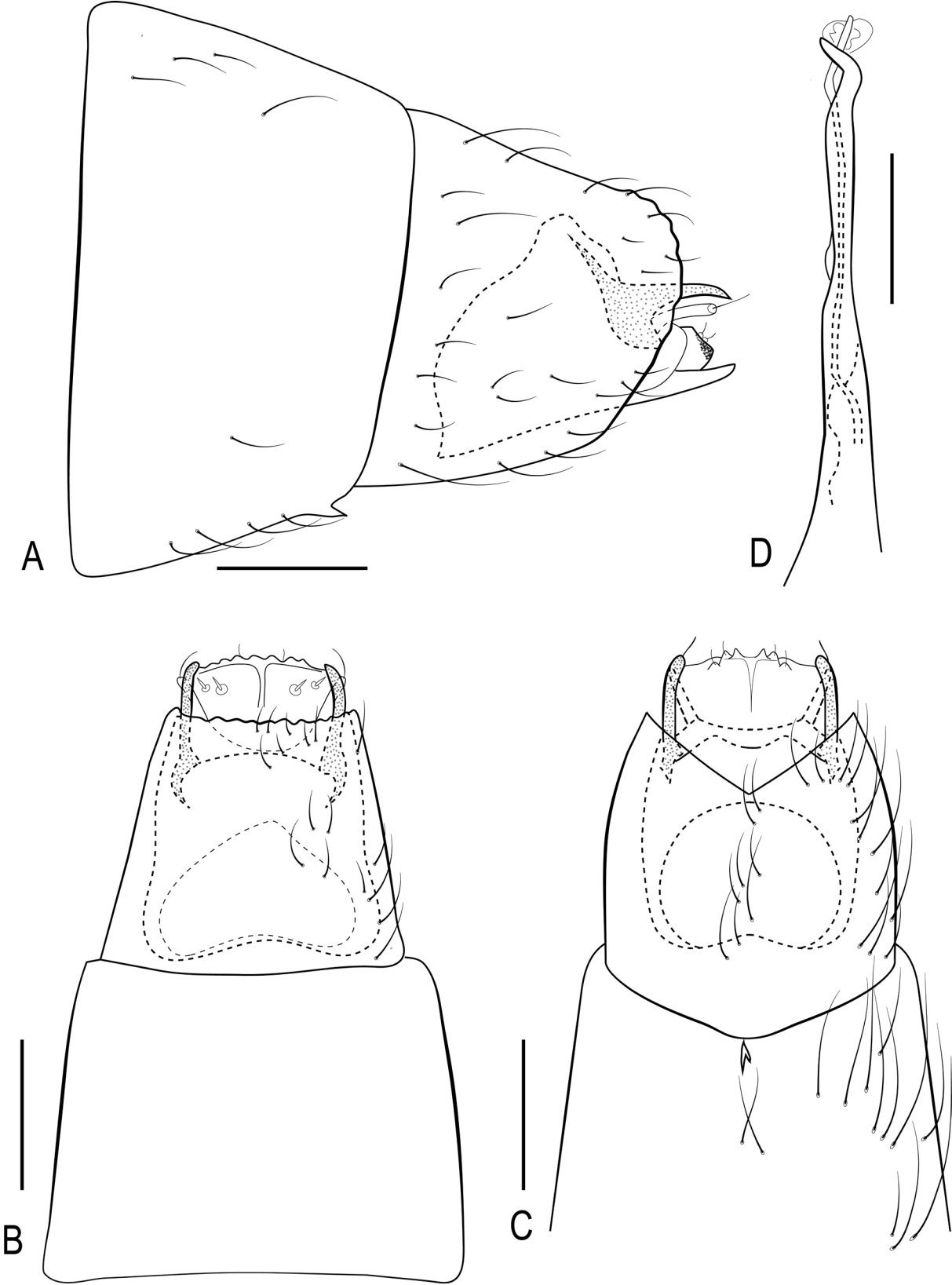
Fig. 2. Oxyethira (Trichoglene) rectangulata sp. nov., male genitalia. A. Lateral. B. Dorsal. C. Ventral. D. Aedeagus, dorsal. Scale bars = 0.1 mm.