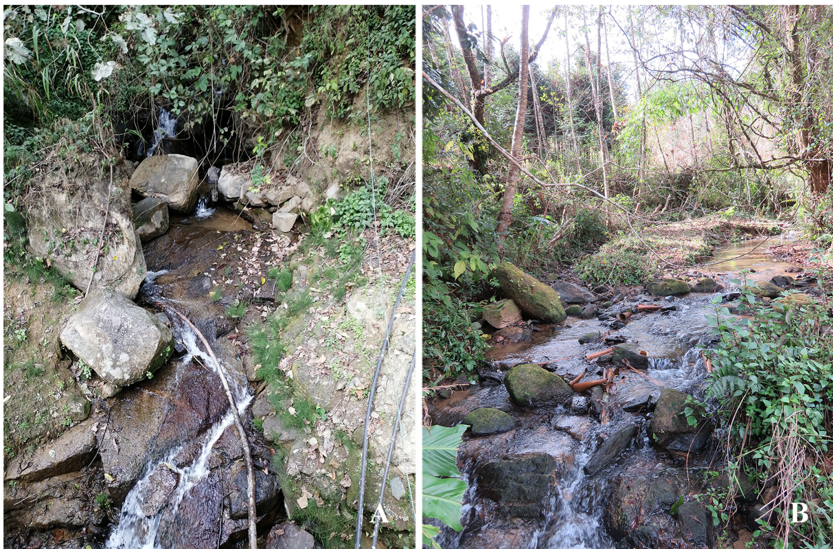
Fig. 3. Habitat of Indonemoura yingjiangensis Bai & Qian sp. nov. and In. longihamata Bai & Qian sp. nov. in Tongbiguan Provincial Nature Reserve. A. The upper reaches of unknown streams. B. The lower reaches of unknown streams.

ABDOMEN (Fig. 2A, C). Abdominal segments generally brownish-yellow and weakly sclerotized. Tergum 9 weakly sclerotized with a thin and transverse sclerite on mid-anterior margin. Tergum 10 weakly sclerotized, median concaved below epiproct, a transverse arc-shaped sclerite anteriorly, two irregular