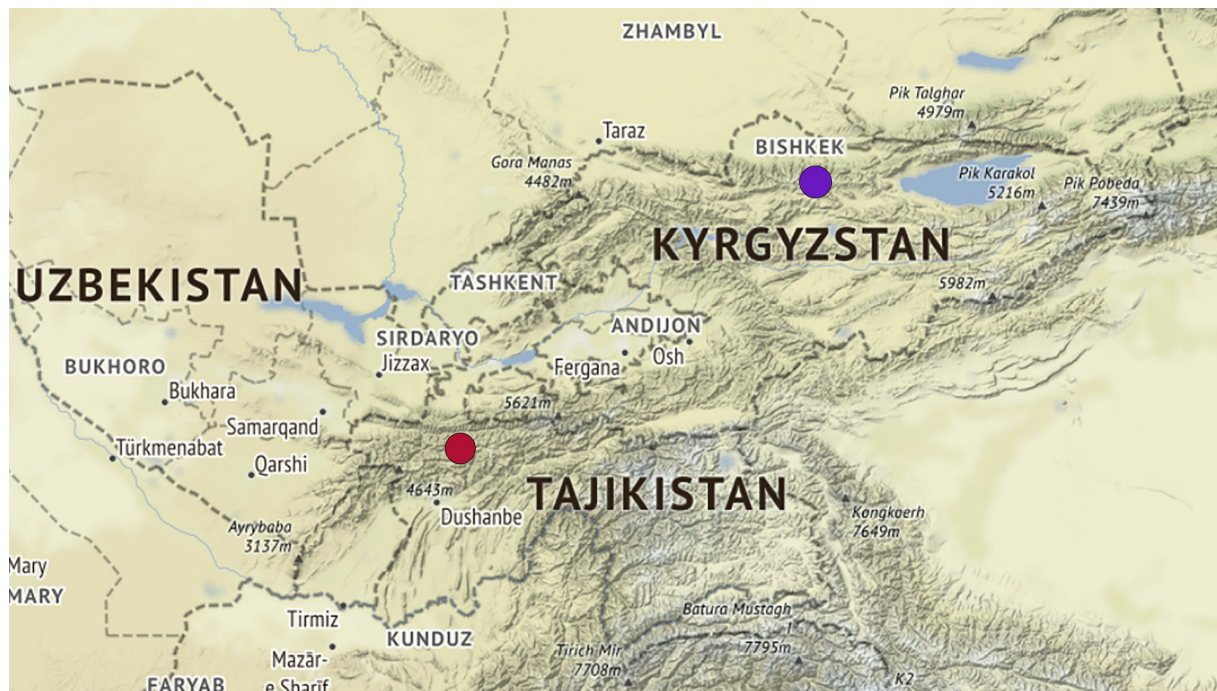
Fig. 2. Distribution map showing the type localities of Quedius gissaricus sp. nov. (red circle) and Q. viator sp. nov. (violet circle).

MEASUREMENTS AND RATIOS. HL: 1.25; HW: 1.39; PL: 1.5; PW: 1.68; EL: 2.02; EW: 1.93; FB: 4.75; TL: 8.84; HL/HW: 0.90; PL/PW: 0.88; EL/EW: 1.05; PL/EL: 0.73; PW/EW: 0.87.