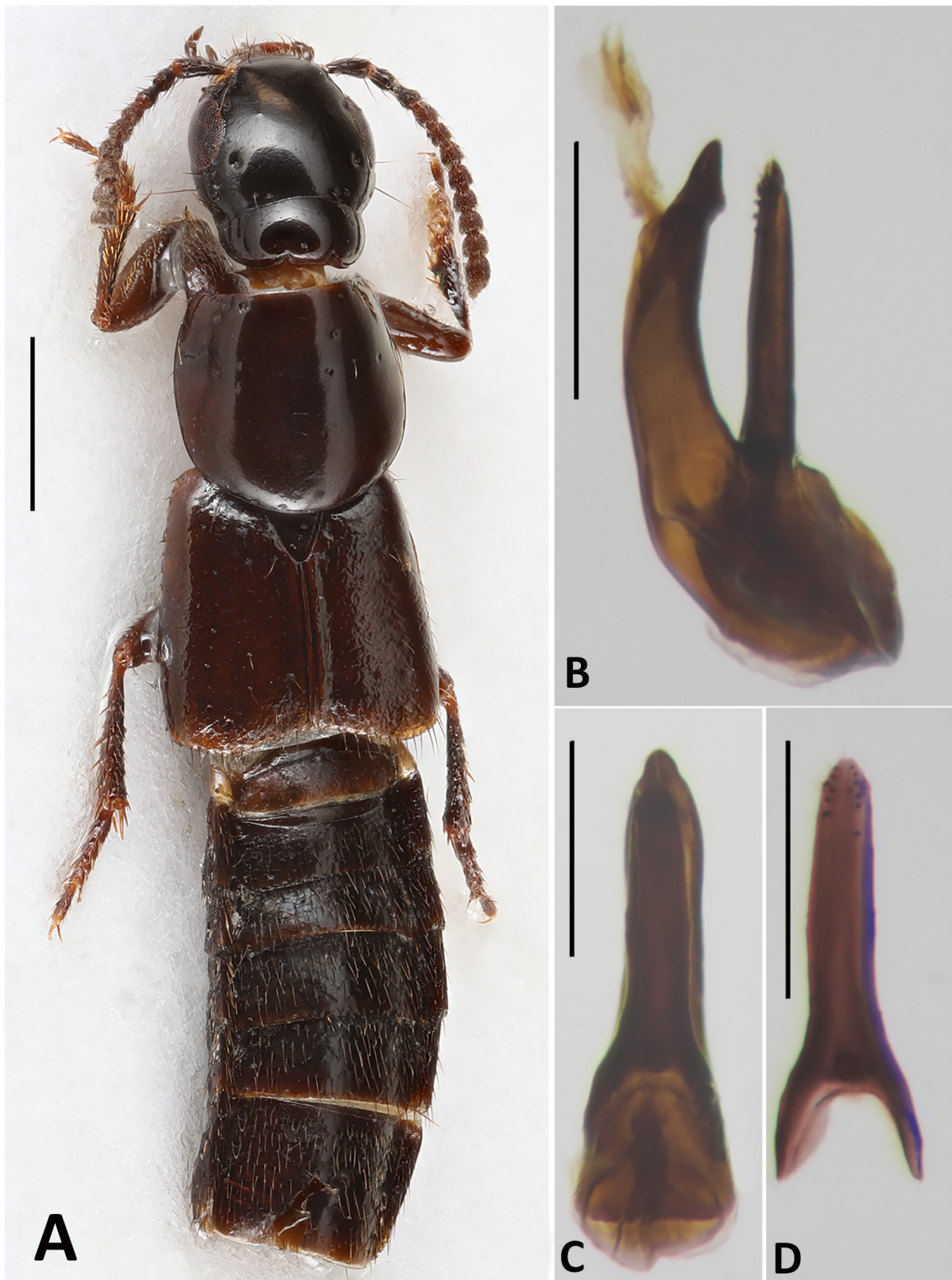
Fig. 4. Quedius sp. aff. gissaricus (ZIN). A. Habitus. B–D. Aedeagus. B. Lateral view. C. From parameral side. D. Paramere (underside). Scale bars: A = 1 mm; B–D = 0.5 mm.