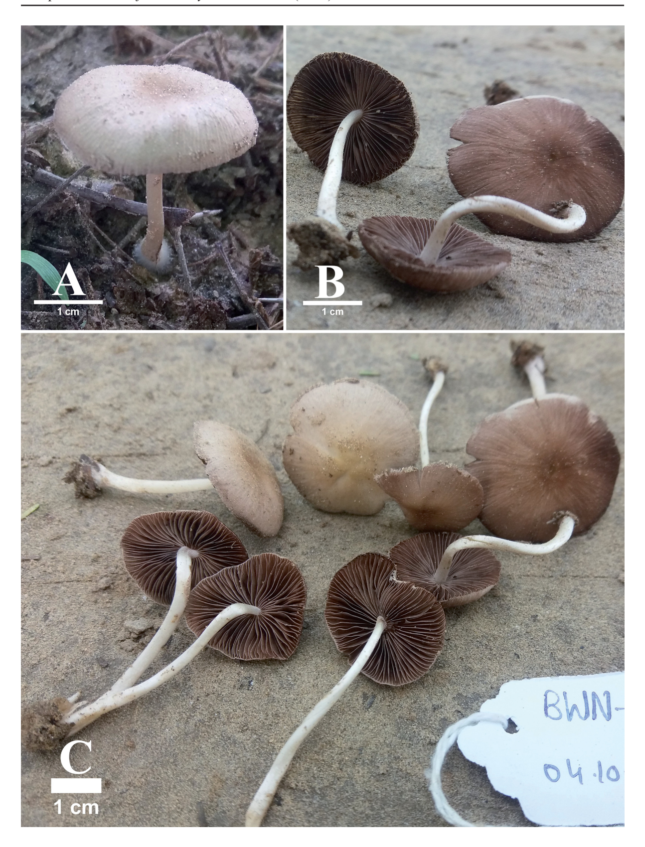
Fig. 2. Candolleomyces asiaticus M.Asif, A.Izhar, Niazi & Khalid sp. nov., holotype (LAH36809). Basidiomata.