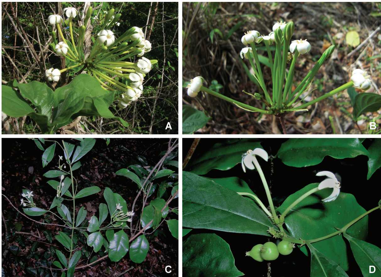
Fig. 2. Species of Cladoceras Bremek. in the field. A–B. Cladoceras rovimense I.Darbysh., J.E.Burrows & Q.Luke sp. nov. (photos: A. Q. Luke; B. P.A. Luke, Mozambique). C–D. Cladoceras subcapitatum (K.Schum. & K.Krause) Bremek. (photos: W.R.Q. Luke, Base Titanium nursery, Kwale County, Kenya).