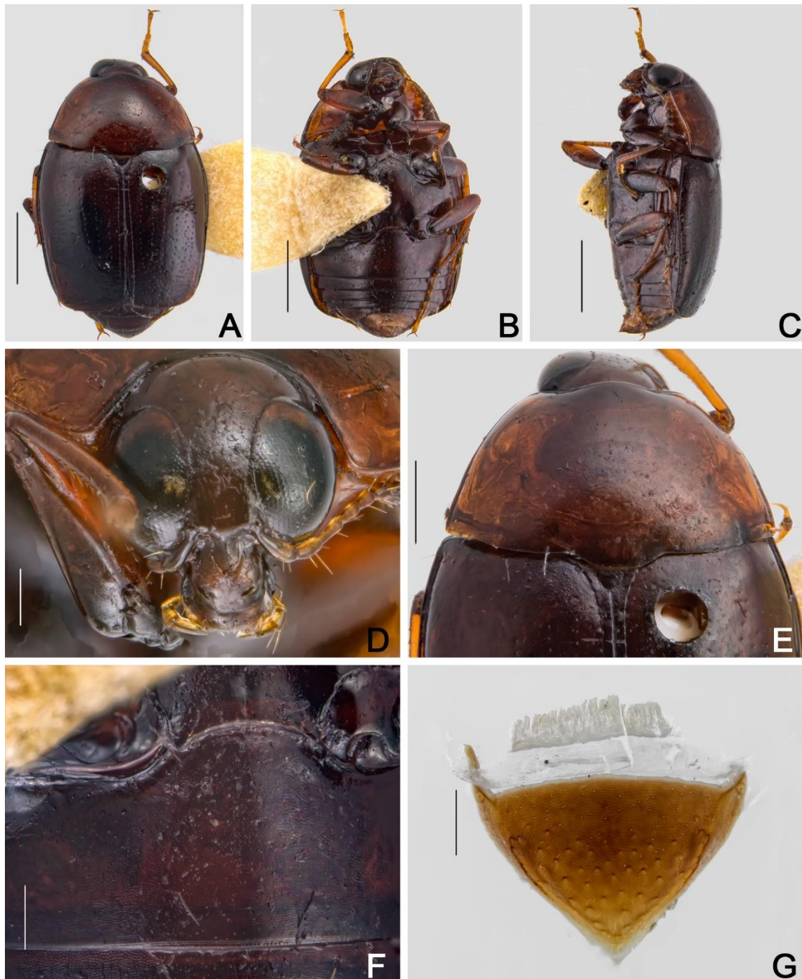
Fig. 3. Cyparium collare Pic, 1920. A–F. ♂ (SE, Sta Luzia do Itanhi, MCN 166404). A. Dorsal view. B. Ventral view. C. Lateral view. D. Frontal view. E. Pronotum, dorsal view. F. Ventrite 1. G. ♂ (SE, Sta Luzia do Itanhi, MCN 166400), tergite VIII. Scale bars: A–C = 1.0 mm; D, F–G = 0.2 mm; E = 0.5 mm.