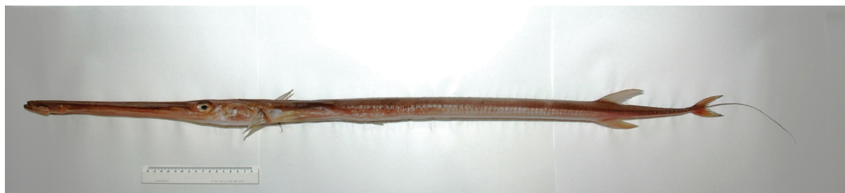
Fig. 3. Fistularia petimba Lacepède, 1803.

Fistularia tabacaria Linnaeus, 1758 – Cornetfish; Corneta-malhada, ②