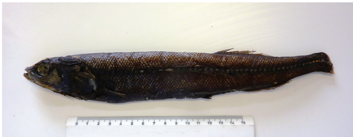
Fig. 2. Bajacalifornia megalops (Lütken, 1898).