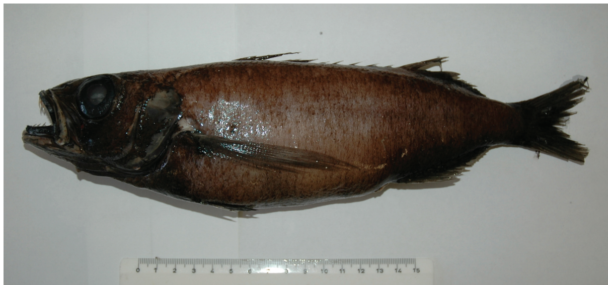
Fig. 4. Scombrlabrax heterolepis Roule, 1921.

New record for Portuguese mainland waters; the first specimen of S. heterolepis (Fig. 4) was caught on the 15 th of November 2008 (300 mm TL and 375.63 g), using a bottom trawl (39°59.257’N, 10°3.025’W) and other specimens were collected in commercial fisheries in 2008 and 2009. Bold Systems Sample ID – MLFPI62, available on the Barcode of Life Data Systems (BOLD; www.barcodinglife.org , under the project titled “Fish of Portugal and Italy [MLFPI]”).