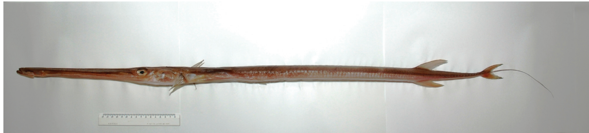
Fig. 3. Fistularia petimba Lacepède, 1803.

Fistularia tabacaria Linnaeus, 1758 – Cornetfish; Corneta-malhada, ②