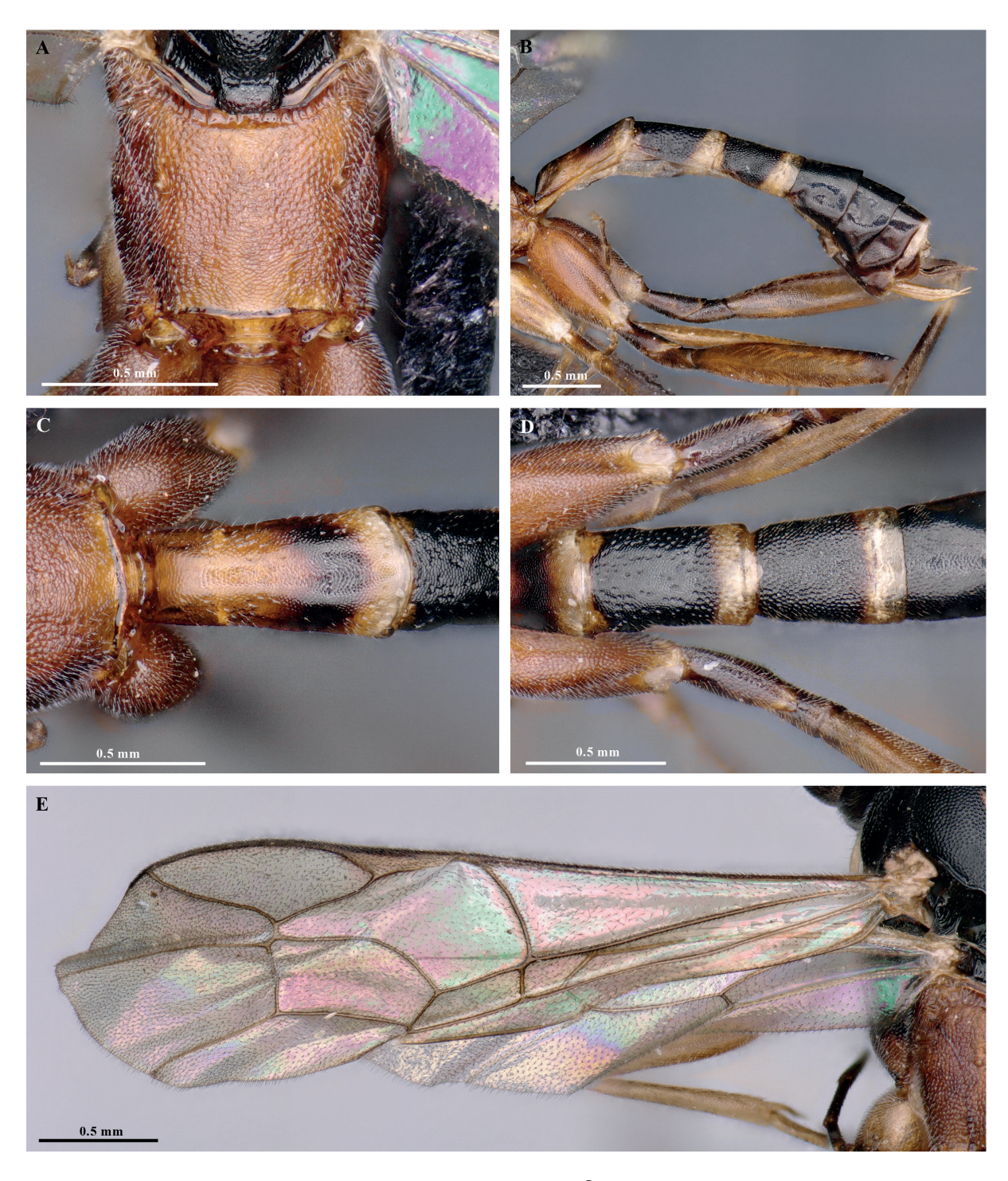
Fig. 2. Shortia karumban Ranjith sp. nov., holotype, ♀ (AIMB). A. Propodeum, dorsal view. B. Metasoma, lateral view. C. First metasomal tergite, dorsal view. D. Metasomal tergite 2–3, dorsal view. E. Fore wing.

Legs. Fore femur 6.3 \times as long as wide. Fore tibia 7.2 \times as long as wide. Fore tarsus 1.6 \times as long as fore tibia. Hind coxa punctate (Fig. 2B). Hind femur 5.8 \times as long as wide and 0.8 \times as long as hind tibia. Hind tibia 10.0 \times as long as wide. Hind basitarsus 10.3 \times as long as wide. Second hind tarsomere 5.8 \times as long as wide. Hind tarsus shorter than tibia (Fig. 1A). Tarsal claws pectinate basally.