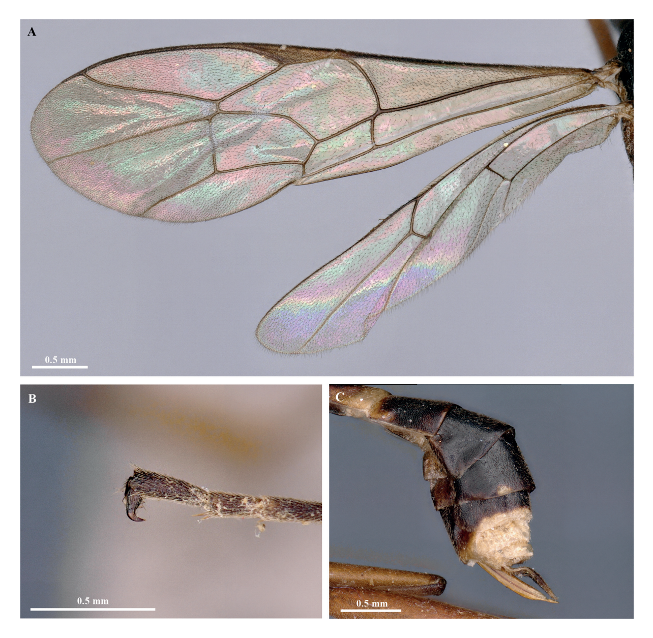
Fig. 5. Shortia manjapulli Ranjith sp. nov., holotype, ♀ (AIMB). A. Wings. B. Tarsal claw. C. Apex of metasoma, lateral view.

Mesosoma. 1.6 \times as long as high. Pronotum coriaceous, punctate anteriorly with a transverse sulcus dorsally with transverse rugae posteriorly (Fig. 3E–F). Epomia absent (Fig. 3E–F). Mesoscutum moderately convex, bordered by lateral carina, punctate, setose, interspace between puncture coriaceous (Fig. 4A). Scuto-scutellar groove shallowly impressed, smooth without crenulations (Fig. 4A). Scutellum mostly coriaceous medially with lateral carina on its anterior \frac{1}{4} , sparsely setose (Fig. 4A). Epicnemial carina straight (Fig. 3F). Mesopleuron coriaceous anteriorly, punctate medially, interspace coriaceous (Fig. 3F). Speculum smooth anteriorly (Fig. 3F). Metapleuron coriaceous, juxtacoxal carina complete, strongly broadened anteriorly and forming a lobe, pleural carina present, complete without interruptions (Fig. 3F). Propodeum mostly coriaceous, setose punctate laterally, posterior transverse carina complete, spiracles round (Fig. 4B).