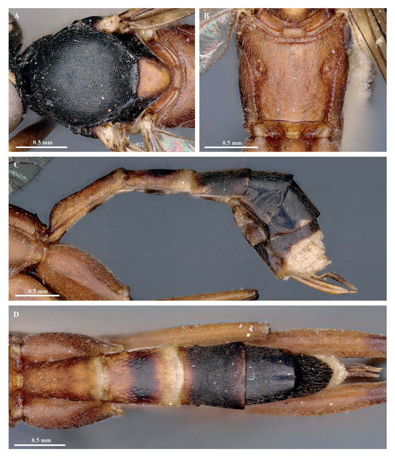
Fig. 4. Shortia manjapulli Ranjith sp. nov., holotype, ♀ (AIMB). A. Mesosoma, dorsal view. B. Propodeum, dorsal view. C. Metasoma, lateral view. D. Metasoma, dorsal view.

Mandible bidentate, upper tooth longer than lower tooth (Fig. 3D). Transverse diameter of eye 4.9 \times as long as temple (Fig. 3C). Frons slightly depressed, coriaceous, sparsely setose (Fig. 3C). Occiliar area slightly elevated (Fig. 3C). Vertex and occiput coriaceous, setose (Fig. 3C). Occipital carina complete medio-dorsally (Fig. 3C). Ratio of OOL: OD: POL = 1.0: 1.2: 1.6. Antenna with 36 flagellomeres. First flagellomere 6.4 \times as long as wide and 1.5 \times as long as second one. Second flagellomere 4.7 \times as long as wide.