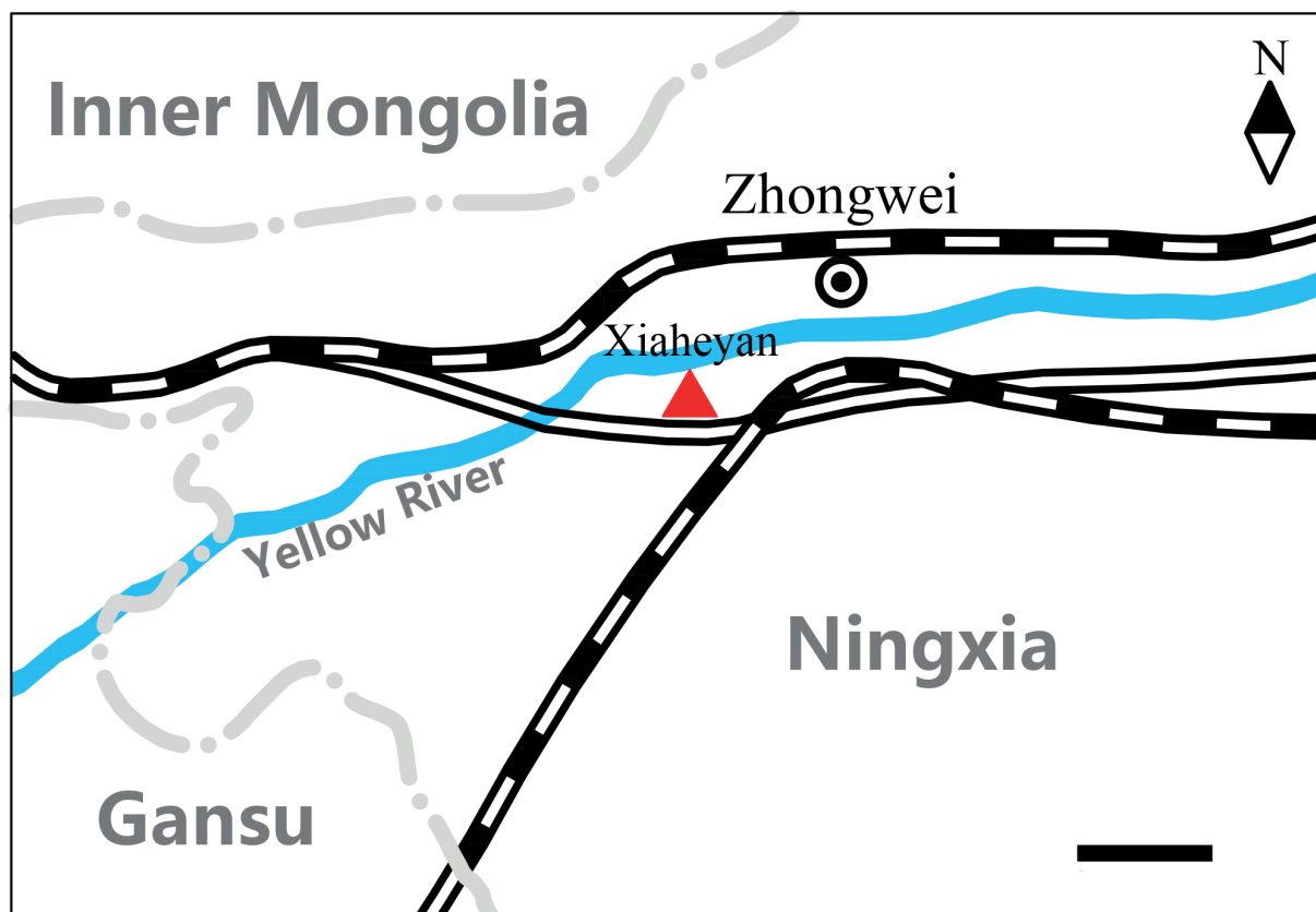
Fig. 1. Map of fossil locality. Red triangle = fossil locality; grey dotted line = limits of regions; continuous double line = secondary road; black and white dotted lines = main roads. Scale bar = 10 km.

We follow the wing venation nomenclature of Riek & Kukalová-Peck (1984) as modified by Nel et al. (1993, 2009) and Jacquelin et al. (2018). We follow the classification of Bechly (2016), as modified by Petrulevičius & Gutiérrez (2016).