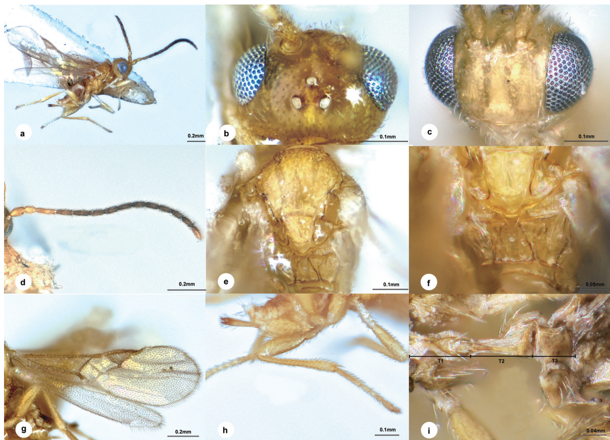
Fig. 1. Rugosimirax obsolescens sp. nov., female, holotype (NHMUK010639261). a. Habitus, lateral view. b. Head dorsal view. c. Head, frontal view. d. Antenna. e. Mesosoma, dorsal view. f. Scutellum and propodeum, dorsal view. g. Wings. h. Ovipositor and hind leg, lateral view. i. T1–T3, dorsal view.

COLOUR. Yellow (Fig. 1a), except notaular courses and metasomal terga brown. Palpi and spurs pale yellow. 2 nd to penultimate flagellomeres and apex of ovipositor sheath brown. Wing membrane hyaline, vein r, pterostigma, 1-SR, 1-M and 1-CU1 brown, other veins light brown.