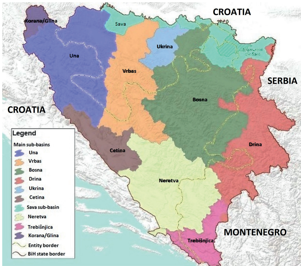
Fig. 2. Map of Bosnia and Herzegovina showing the main catchments. From: Hamzić A. 2024. Biodiverzitet slatkovodnih riba Bosne i Hercegovine . Buybook, Sarajevo.

The Sava River is the most prominent river connecting Croatia, BiH, and Serbia. Together with its tributaries, it constitutes one of the major catchments of Southeast Europe, covering a total area of approximately 97 713.20 km 2 . The Sava River is also one of the largest catchments of the Danube River Basin, accounting for 12% of its catchment area in BiH (Jukić 2008). With the exception of the Neretva River, all the major rivers in BiH flow into the Sava River, the largest tributary of the Danube. The Drina River is the Sava River's largest and most important tributary. The Drina River catchments extend into four countries: Montenegro, BiH, Serbia, and a very small part extends into Albania. Other important catchments include the: Una, Vrbas, Bosna, Ukrina, Korana, and Glina Rivers. The Adriatic Basin area of BiH, in turn, consists of three catchments: Neretva, Trebišnjica and Cetina Rivers (Fig. 2). The Neretva River catchment has an area of 10 100 km 2 or 81.4% of the total Adriatic Basin area of BiH, the Trebišnjica River catchment area has 2250 km 2 , while the Cetina River catchment spreads over 2310 km 2 (18.6% of the total Adriatic Basin area of BiH) (Hamzić 2024). The Neretva and Cetina rivers flow into the Adriatic Sea, while the Trebišnjica River