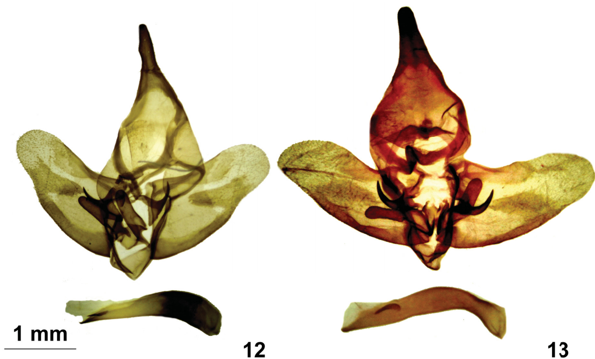
Figs 12–13. Afroarabiella species (male genitalia). 12. A. sulaki sp. nov., male genitalia. 13. A. strohlei sp. nov., male genitalia.