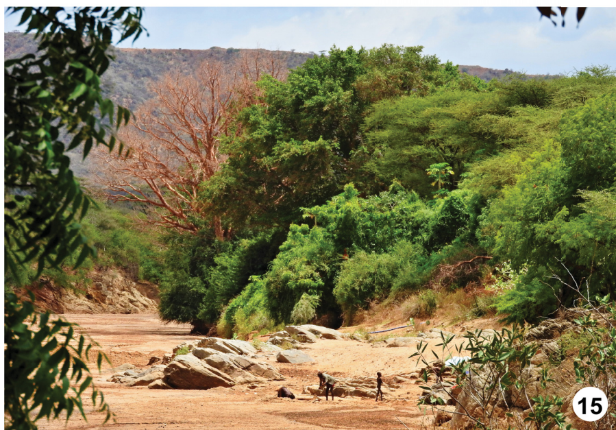
Figs 14–15. Afroarabiella species (type localities). 14. A. sulaki sp. nov., type locality. 15. A. strohlei sp. nov., type locality.