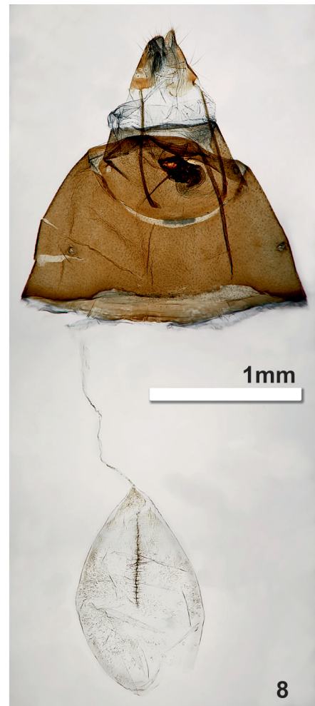
Figs 6–8. Singularia guajiro Kovtunovich & Ustjuzhanin sp. nov. 6. Holotype (ZISP 1842). 7. Holotype, genitalia (ZISP 1842). 8. Paratype, ♀, genitalia (ZISP 1843).