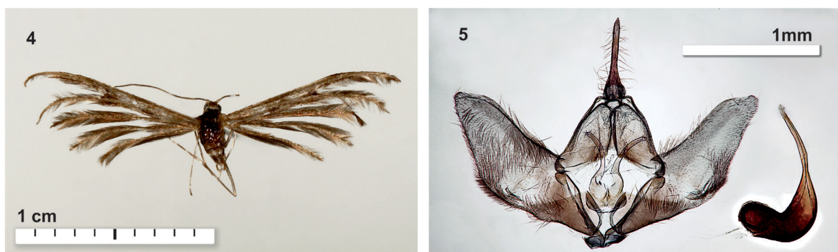
Figs 4–5. Singularia sinjaevi Kovtunovich & Ustjuzhanin sp. nov. 4. Holotype (ZISP 1838). 5. Holotype, genitalia (ZISP 1838).

The species is named after Viktor Synjaev, the prominent Russian traveller and entomologist, who collected this species.