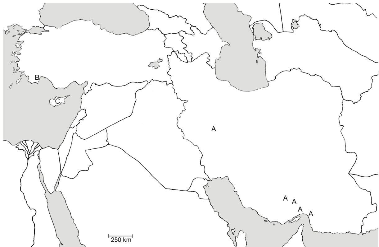
Fig. 3. Distribution of Brachypsectra in the Palearctic Region. A = B. kadleci Hájek, 2010; B = B. jaechi sp. nov.; C = Brachypsectra sp. from Cyprus.

There is intraspecific variability in populations of B. kadleci . Specimens from the type locality (Lorestan, western Iran; Fig. 3) are distinctly bicolored with darker elytra (Fig. 1A–B) and have the median lobe of the aedeagus almost sub-parallel, more distinctly attenuating subapically (Fig. 2D). Specimens collected in southern Iran (Fig. 3) are almost uniformly yellowish-testaceous to testaceous (Fig. 1C–D), with the median lobe of the aedeagus more gradually narrowed towards the apex (Fig. 2E). Taking into consideration the gradation in elytral coloration (from yellowish-testaceous through testaceous and reddish-brown to dark brown; Fig. 1A–D), slight differences in the shape of the median lobe and the rarity of the specimens available for study, we refrain here from making any taxonomic conclusions and consider all specimens from Iran conspecific. Brachypsectra fulva from North America and Brachypsectra