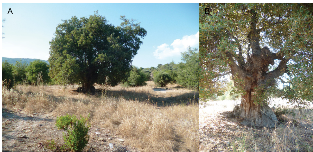
Fig. 4. A. Habitat of Brachypsectra sp. from Cyprus, Vretsia. B. Quercus infectoria Olivier.

We are not able to assign the Brachypsectra female and larva from Cyprus to any described species since only males are known in B. kadleci and B. jaechi sp. nov. The distribution of Brachypsectra species as well as the larger eyes in the female suggest its close relationship to B. jaechi sp. nov. from Turkey rather than to B. kadleci from Iran. The specimen from Cyprus differs from B. jaechi sp. nov. in having a lighter prosternum and mesoventrite, wider pronotal posterior angles with posterior carina very close to the lateral carina, and a shallower emarginate apex of the scutellum; however, we cannot exclude the possibility that this is only a result of sexual dimorphism. Until more material of both sexes and/or larvae for the Palaearctic species is available for study, we retain the population from Cyprus as Brachypsectra sp.