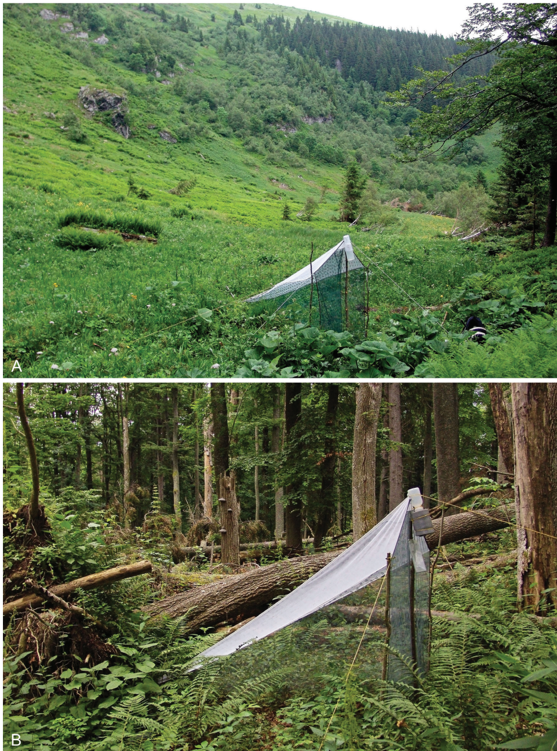
Fig. 2. Sampling localities. A. Velká Kotlina Glacial Cirque (Czech Republic) with a Malaise trap used in 2006. Frequent avalanches are the main cause of the unique subalpine biodiversity of this locality (e.g., more than 350 species of vascular plants have been recorded from there) B. Hrončecký grúň Reserve in Poľana Mts (Slovak Republic) with a Malaise trap used in 2005. This is a virgin forest mainly composed of fir and beech intermixed with ash, spruce and sycamore maple and with an enormous and unique diversity of flies (see Roháček & Ševčík 2009).