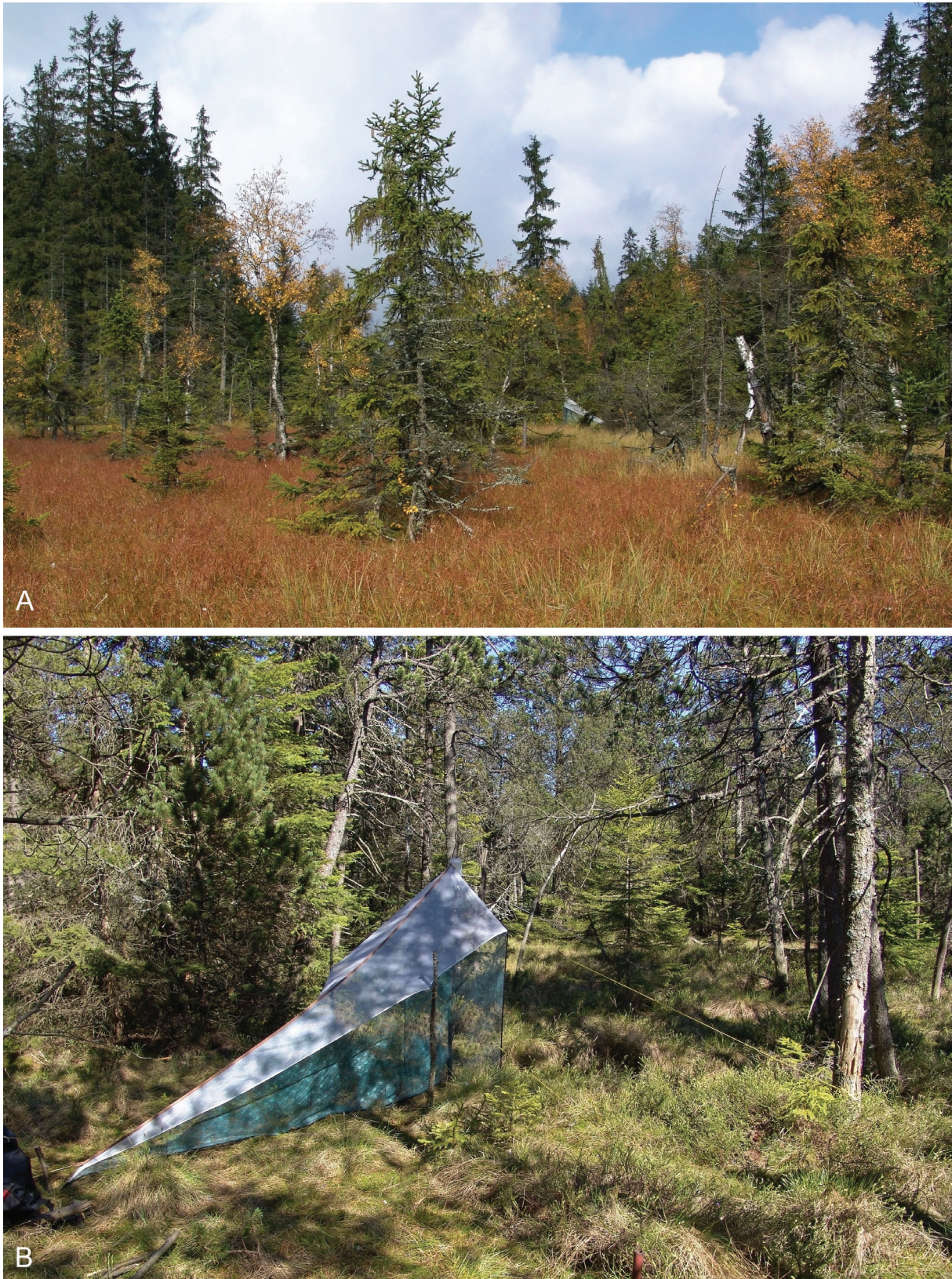
Fig. 1. Sampling localities. A. Rejvíz peat-bog (Czech Republic) with a Malaise trap used in 2004. A well preserved postglacial peat-bog with Pinus rotundata growth. B. Rejvíz peat-bog with the Malaise trap used in 2005.