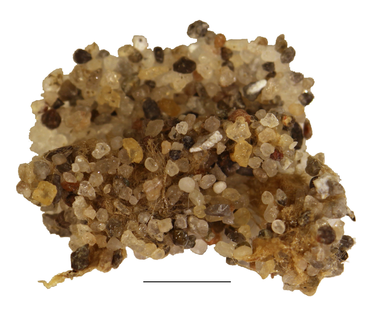
Fig. 2. Modiolus cimbricus sp. nov. A 17.5 mm long specimen in its ball of sand grains. This specimen has been cultured for five years. Scale bar = 5 mm.

A plausible hypothesis is that Modiolus cimbricus sp. nov. has evolved into a separate species after the Weichselian glaciation. It closely resembles M. adriaticus , from which it has evolved. The latter species belongs to the Lusitanian (Mediterranean) fauna that today has its northern border on the south and west coasts of the British Isles, including the Irish Sea (Ekman 1953; Hylleberg & Riis-Vestergaard 1984) (Fig. 3). This fauna is characterized by its corresponding Mediterranean-influenced water masses from the south. Today, a branch of the Gulf Stream presses towards the northwestern parts of the British Isles and the North Sea. It fills the latter with its water and results in a very stable current pattern because it is determined by sufficient water depth that allows for three amphidromic points in the North Sea (Dietrich 1963; Jelgersma 1979; Lund-Hansen et al. 1994; see also below). Consequently, the edge