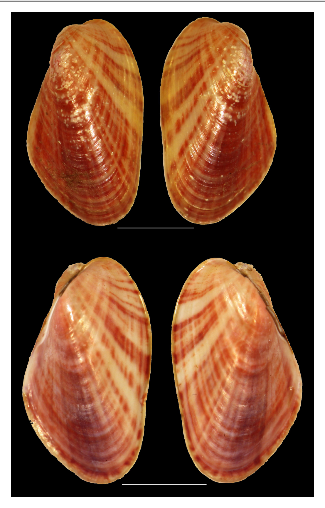
Fig. 1. Modiolus cimbricus sp. nov., holotype (shell length 13.3 mm). The upper part of the figure shows the external shell side and the lower part shows the inner side of the valves. Scale bars = 5 mm.