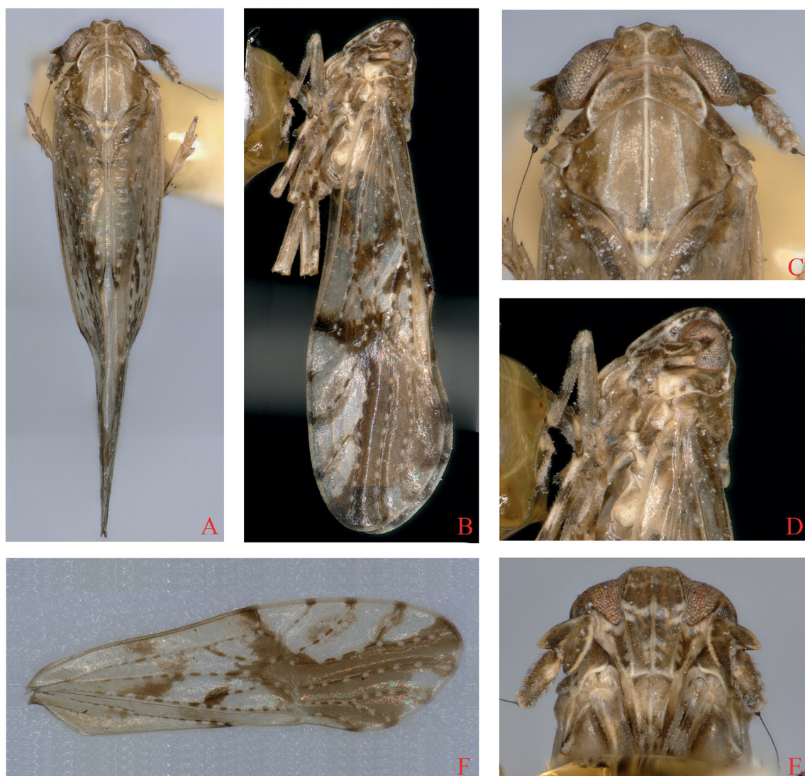
Fig. 3. Neobelocera russa sp. nov., holotype (GUGC-FS-TN-20100801). A. Male habitus, dorsal view. B. Same, lateral view. C. Head and thorax, dorsal view. D. Same, lateral view. E. Face. F. Forewing.

MALE GENITALIA. Anal segment small, ring-like (Fig. 4D). Pygofer in profile much longer ventrally than dorsally (Fig. 4E), in posterior view with opening longer than wide, ventral margin with three medioventral processes, median one longer than lateral ones, truncate apically, lateral ones stout, tapering (Fig. 4D). Aedeagus (Fig. 4F–G) with phallobase, phallus tubular, bent ventrad medially, with node at apex, middle dorsal with a spinous process, directed dorsad, apex with 2 long spinous processes. In addition, 2 processes at subapical part of phallus, right one strongly curved. Phallobase