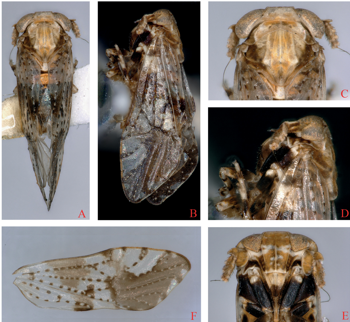
Fig. 1. Neobelocera biprocessa sp. nov., holotype (GUGC-FS-TN-20090401) A. Male habitus, dorsal view. B. Same, lateral view. C. Head and thorax, dorsal view. D. Same, lateral view. E. Face. F. Forewing.

The salient features of the new species include the following: frons with pale transverse band below level of lower margin of eyes (Fig. 2B); antennal segment I subsagittate, markedly flattened, with median longitudinal carina, the ventral apical angle longer than dorsal apical angle (Fig. 2B); ventral margin